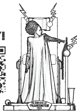
The Bride of Frankenstein 1935